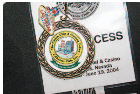
Hall of Fame member medal