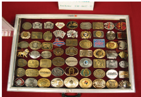
Jim Kruse's gamblers belt buckle display