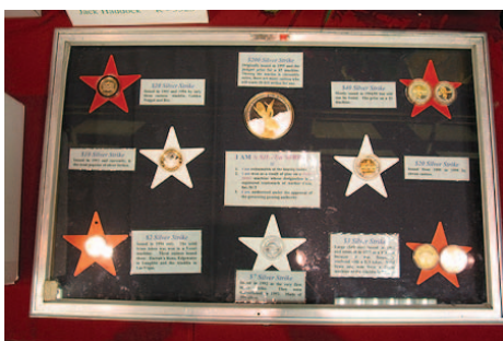
Jack Haddock's I am a silver striker exhibit