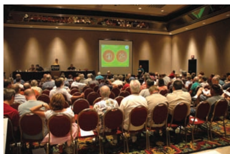
Bruce Landau Memorial Auction