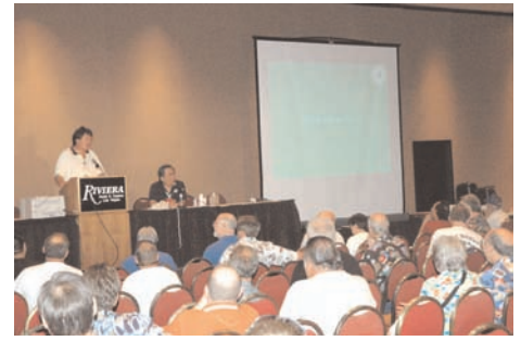
Chip stories seminar