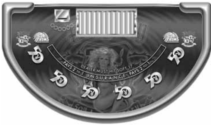
One of the designs for the blackjack table