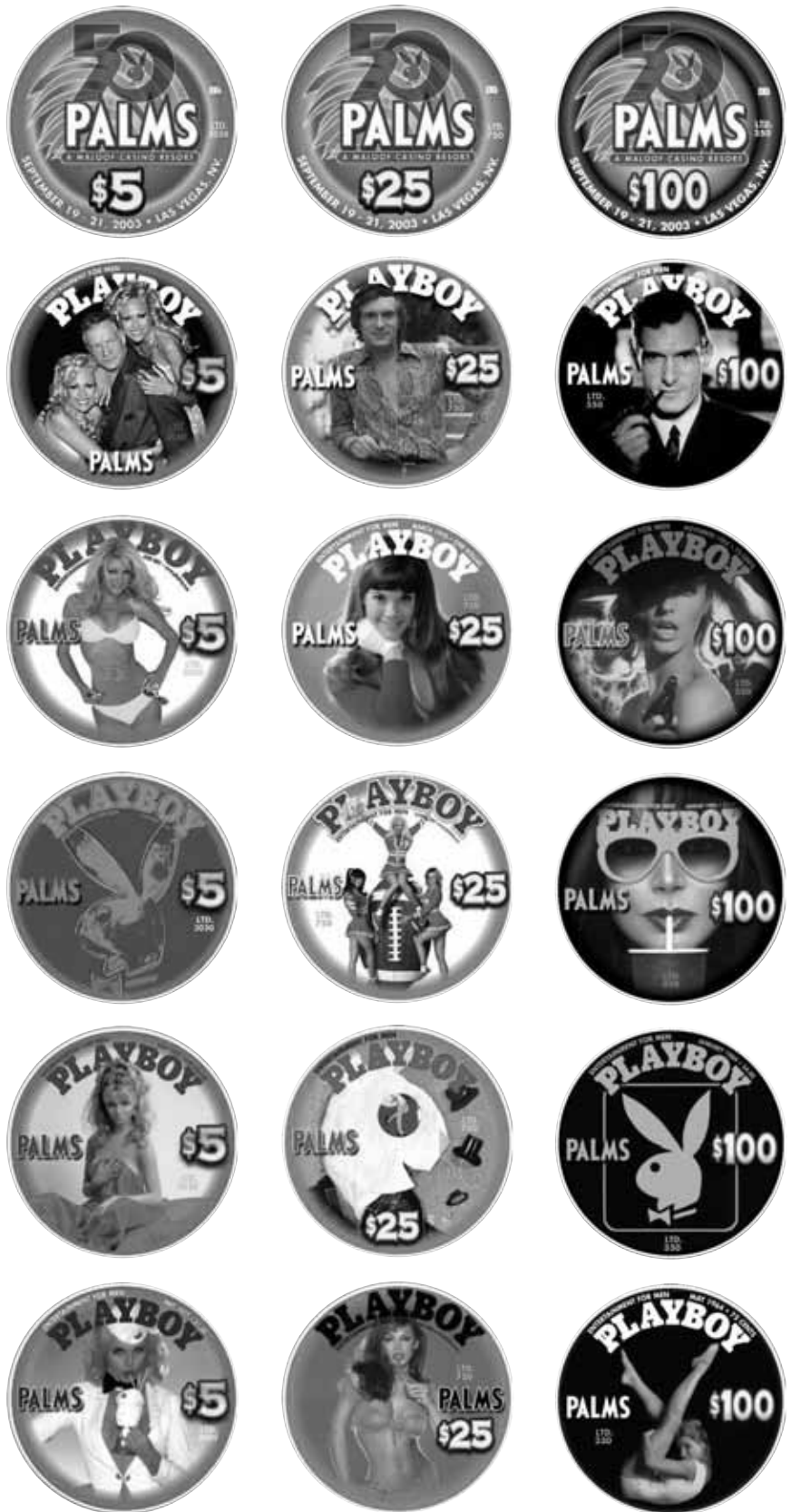
Final chip designs

July 19 the final artwork went to NV Gaming – 8 weeks to release and Bourgoigne et Grasset would be closed for the middle 4 weeks. Gaming was aware of our short time line and gave verbal approval on July 20. Paul-Son rep gave us a guaranteed delivery date of Sept 16, two days before the release. One week of this would be tied up in shipping and customs. As of this writing, September 7, I am on pins and needles!