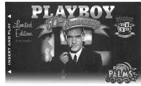
Playboy 50th Anniversary room keys