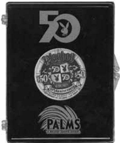
Special case for $50 chip