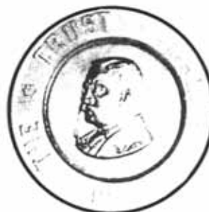
PE-TR T. Roosevelt Embossed / v:h