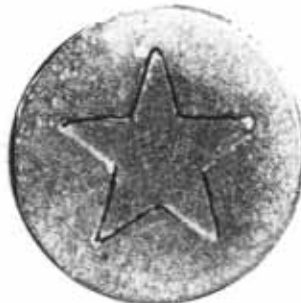
PD-KI Star Embossed / v:f