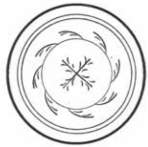
IF-CM Four Straws / v:l