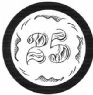
IP-CR(better graphic) 3/F/3/2 / v:m