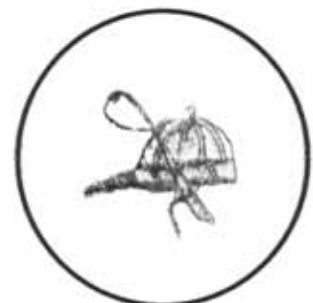
PS-GN Cap & Whip Engraved / v:h