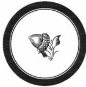
IE-UEb Acorn / v:l