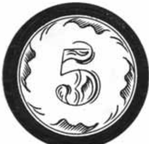
IN-UK 3/F/3/2 / v:m