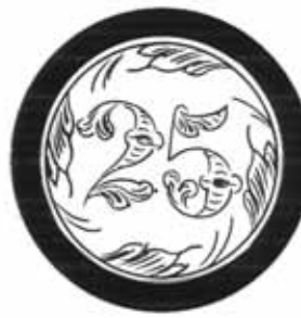
IP-KP S/U/U/2 / v:n