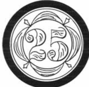
IP-PJ 3/3/3/U / v:0