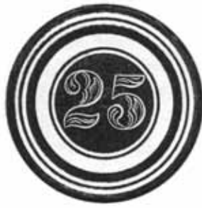
IO-SH 3/F/2 / v:m