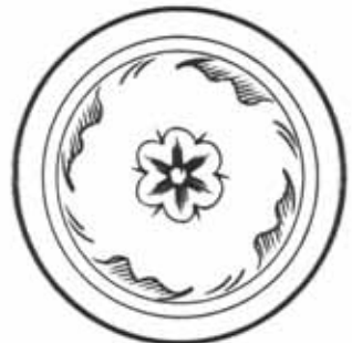
IE-NI Blossom / v:k