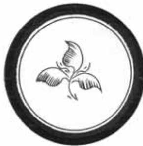
IE-JL Three Leaves / v:k