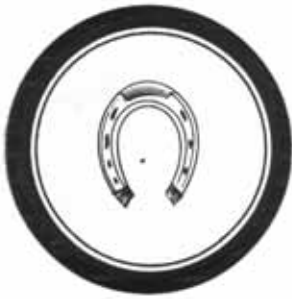
ID-GJ Horseshoe / v:k