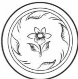
IE-SZa Flower / v:l