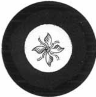
ID-WQ Four Leaves / v:k