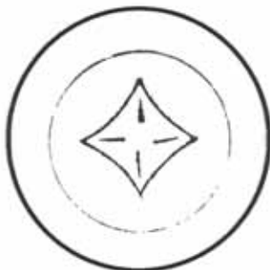
PD-CU Kite Engraved / v:g