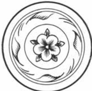
IE-PP Blossom / v:k