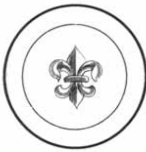
ID-LO Fleur-de-lis / v:k