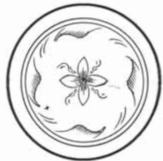
ID-TC Four Petals / v:k