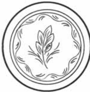
IE-GW Single Leaf / v:k