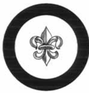
ID-LP Fleur-de-lis / v:k