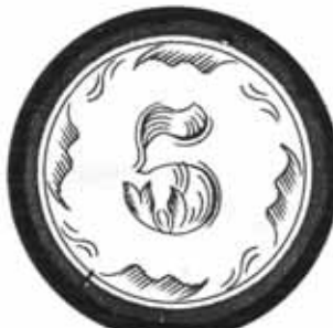
IO-Cla 8/3/S/3 / v:m