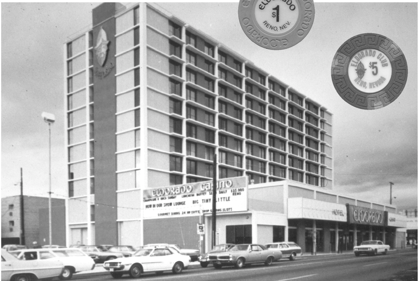
Eldorado Hotel 1973

From deluxe king rooms to whirlpool suites and majestic theme suites, the Eldorado offers accommodations for all tastes. Each of the 817 hotel rooms is finely-appointed and extras include everything from plush linens and fabrics to