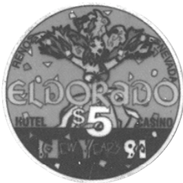
New Years 1991

The Eldorado is located in the heart of downtown Reno on the corner of Fourth and Virginia streets. Call 1-800-648-5966 for room reservations or more information. In Nevada, please call (775)786-5700. Check out the Eldorado's website at eldoradoreno.com .