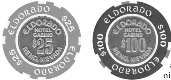
Obsolete $25 and $100

Casino space totals 81,000 square feet and contains 2,000 slot machines, 90 table games, three keno lounges and a full-service race and sportsbook. Additional amenities include, free valet and garage parking, 24-hour room service, video arcade, heated outdoor