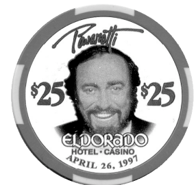
Pavarotti 1997