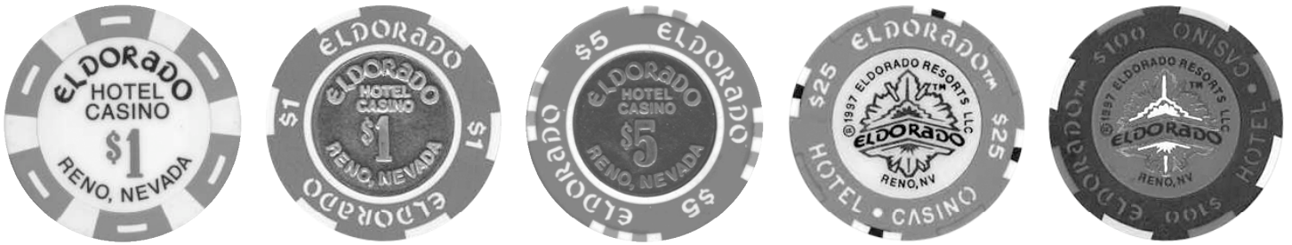
Current House Chips

offering American, Italian and Chinese specialties - Reno's hot spot for fast, fresh food.