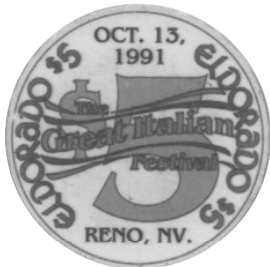
Great Italian Festival 1991