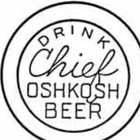
PY-OS Oshkosh Stamped Paper