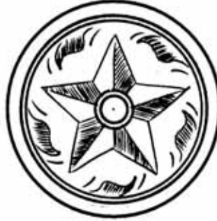
ID-PK Star / v:p