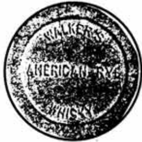
PY-WE Walker's Am R. Embossed