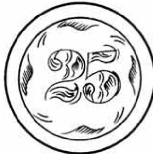
IP-DS 3/F/3/2 / v:m