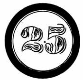
IO-SD 3/F/2 / v:m