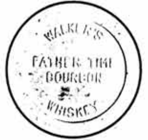
PY-WN Walker's Father T Embossed