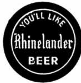
PY-RH Rhineland Stamped Paper