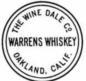
PY-XR Warrens Engraved