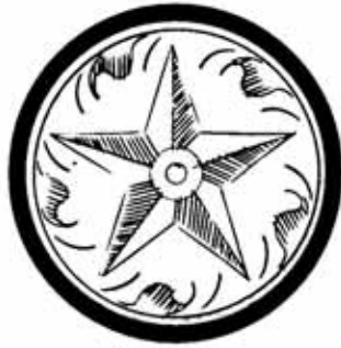
ID-PJa Star / v:p