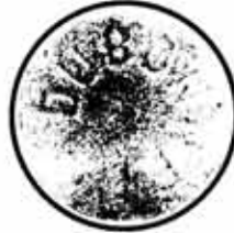
PY-DU Dubonnet Embossed