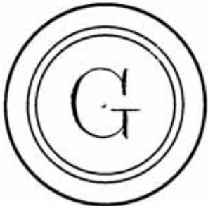
IM-EM G / v:m