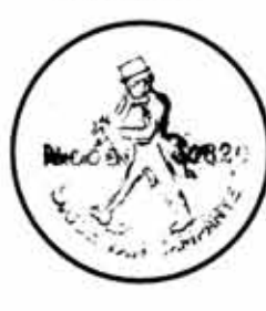
PY-XJ Johnnie Walker Engraved Celluloid