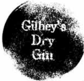
PY-EO Gilbey's Dry Gin Stamped Wood