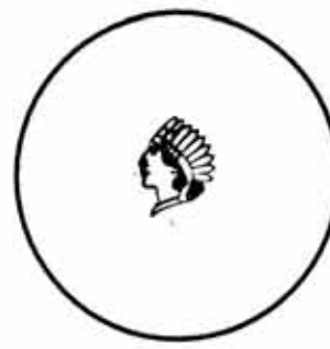
PE-JM Indian Head Stamped / v:f