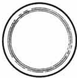
IX-TK 3B 3W (30/27) / v:i