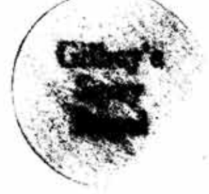
PY-EQ Gilbey's Spey Royal Stamped Wood