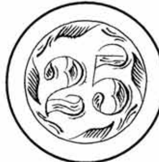
IP-DYa 3/F/3/3 / v:m