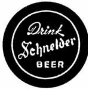
PY-SC Schneider Engraved Paper