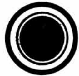
IX-LQ 2B 2W (30/27) / v:i