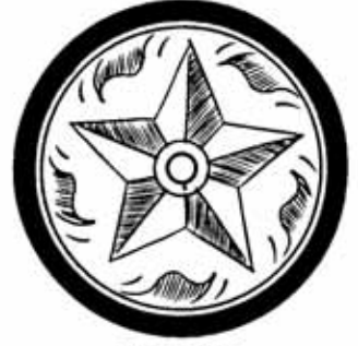
ID-PKa Star / v:p