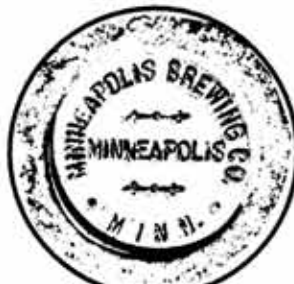
PY-MN Minn. Brewing Embossed