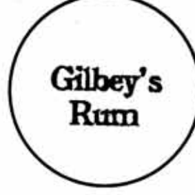
PY-ER Gilbey's Rum Stamped Wood