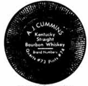
PY-DK Cummins Embossed Paste-On