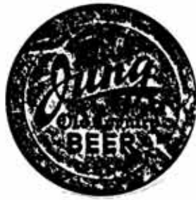
PY-HN Jung Beer Stamped Paper