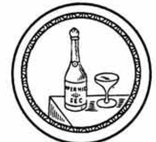
PY-PW Piper Heidsieck Engraved