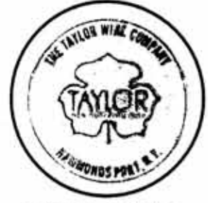
PY-TH Taylor Wine Engraved Paper