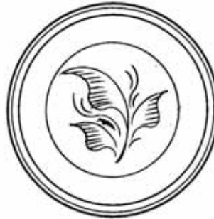
IE-KV Three Leaves / v:l