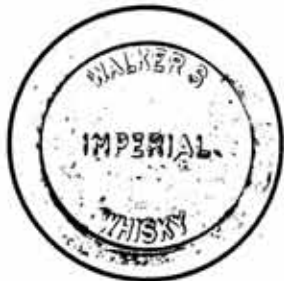
PY-WP Walker's I. W. Embossed