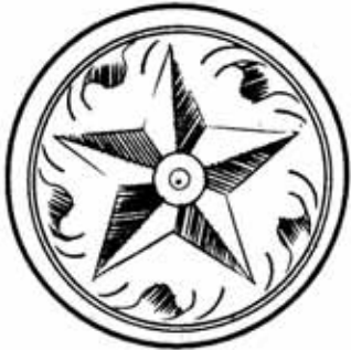
ID-PJ Star / v:p