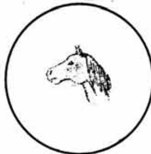
PA-KU Horsehead Stamped / v:g