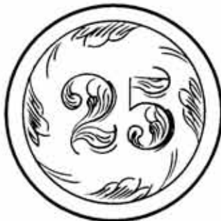
IP-AH 3/2/2/2 / v:m