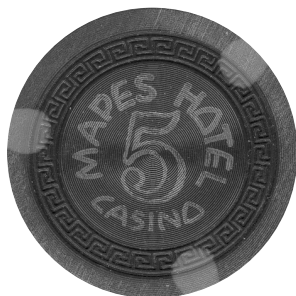
$5 SmKey brown w/ 3-1/4 orange