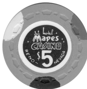
$5 SmCrown f-orange w/ 3-3/8r