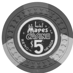
$5 HRGLS blue w/ 3-1/2 alt.