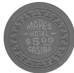
$5 T's purple