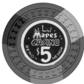
$5 HRGLS maroon w/ 3-1/2 alt.