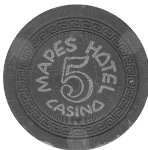
$5 SmKey purple w/ 3-1/4 red