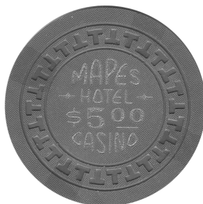
$5 T's purple w/ 4-1/4 red