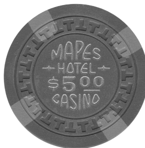
$5 T's maroon w/ 4-1/4 green