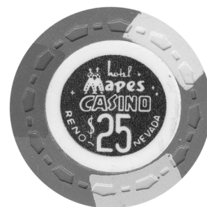
$25 SmCrown green w/ 3-1/2 alt.