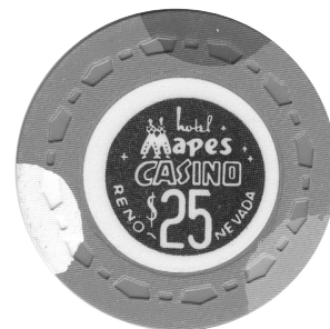
$25 SmCrown blue w/ 3-3/8r