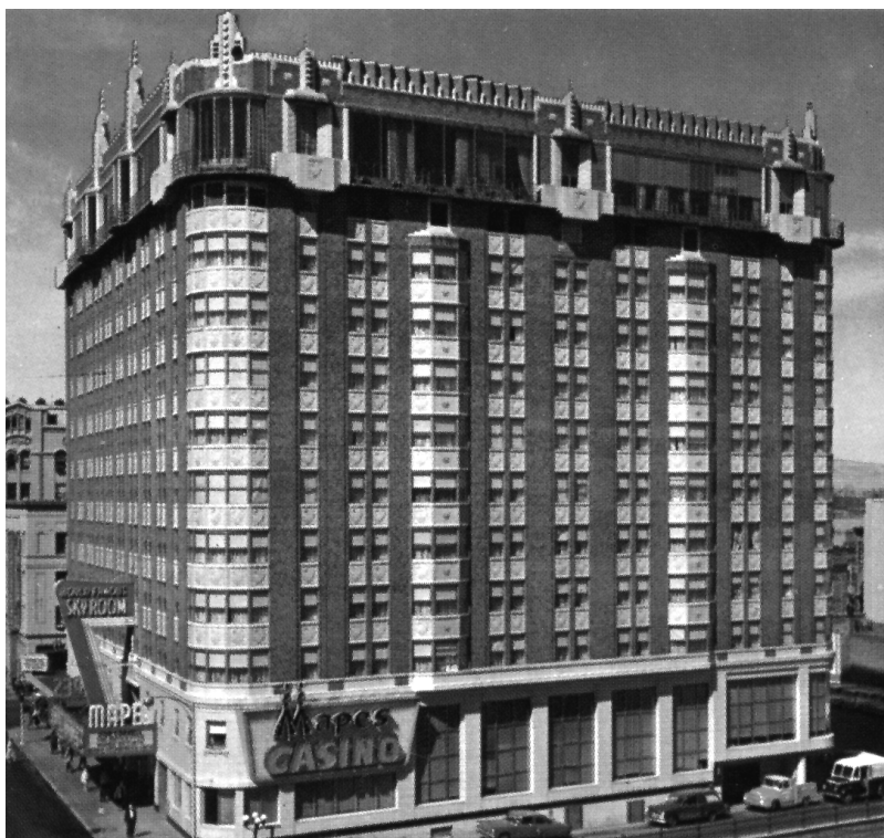
Mapes Hotel Skyroom