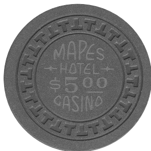
$5 T's maroon