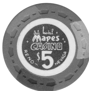
$5 Sm Crown brown w/ 3-1/2 alt.