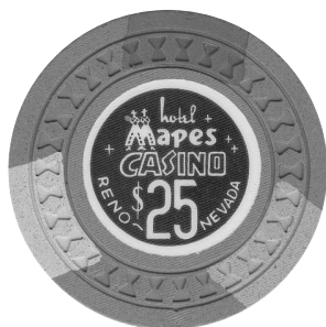
$25 HRGLS green w/ 3-1/2 alt.