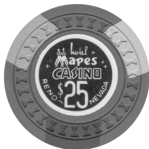
$25 HRGLS red w/ 3-1/2 alt.