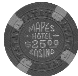
$25 T's green w/ 4-1/4 cream