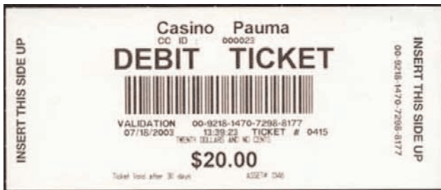
Front: Debit Ticket The result of an ATM transaction.

Quik Play personnel have been at Casino Pauma promoting the system, handing out promotional calendar cards, and answering customer questions.