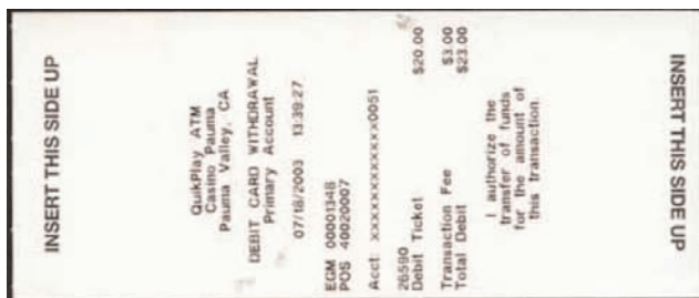
Front: Customer Receipt Optional receipt. Shows $3 fee.