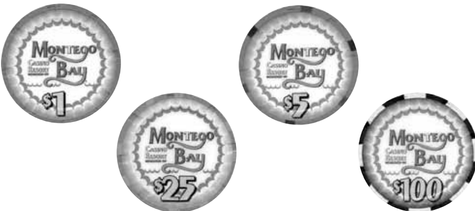
Montego Bay Casino House Chips

and the Smith family's Silver Smith has been purchased by the Peppermill and re-named Montego Bay.