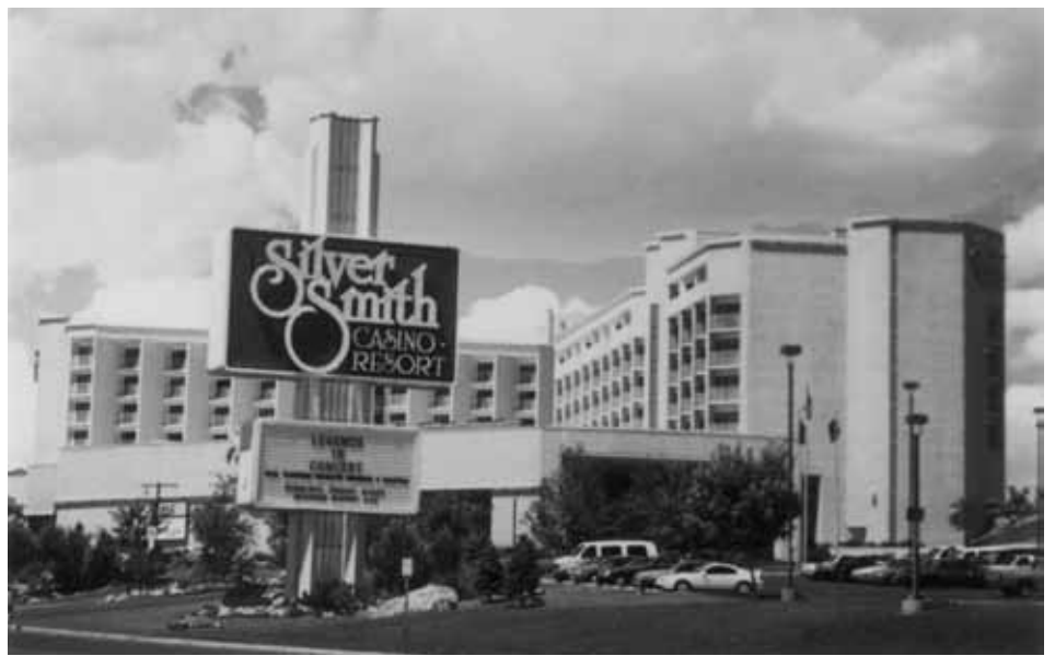
Silver Smith Hotel, Casino