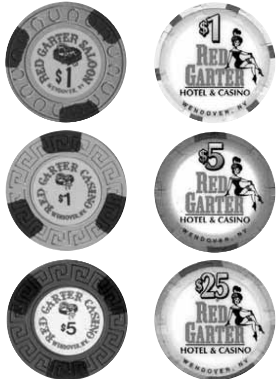
Red Garter Casino House Chips