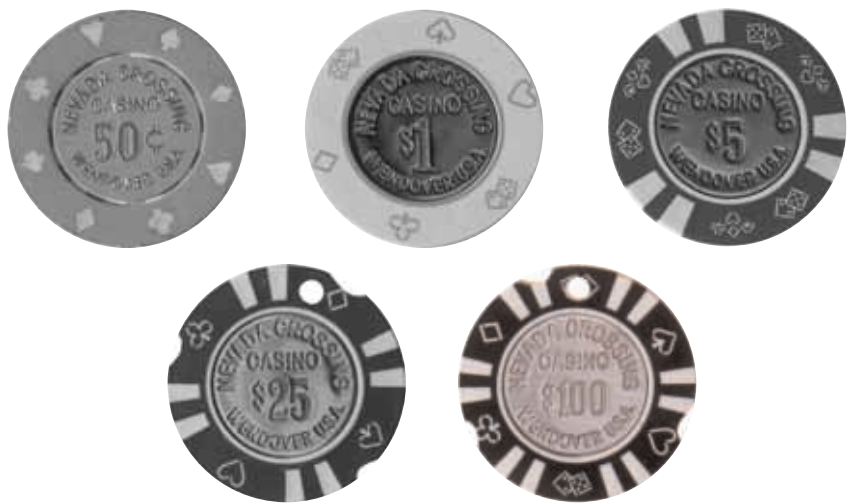
Nevada Crossing Casino Chips