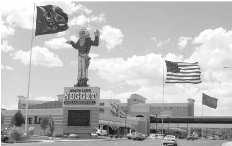
State Line Nugget