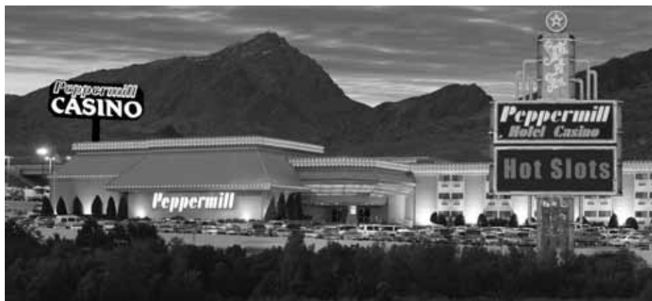
Peppermill Hotel, Casino

as legendary entertainment and gaming establishments. With the largest Poker room and the only Race and Sports book in town.