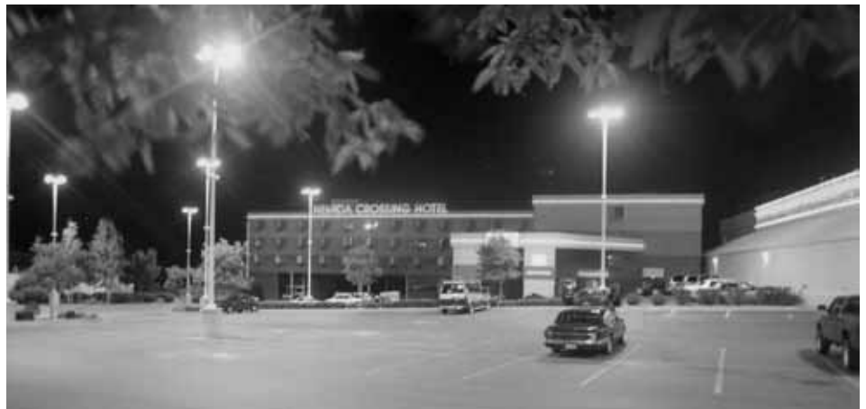
Nevada Crossing Hotel