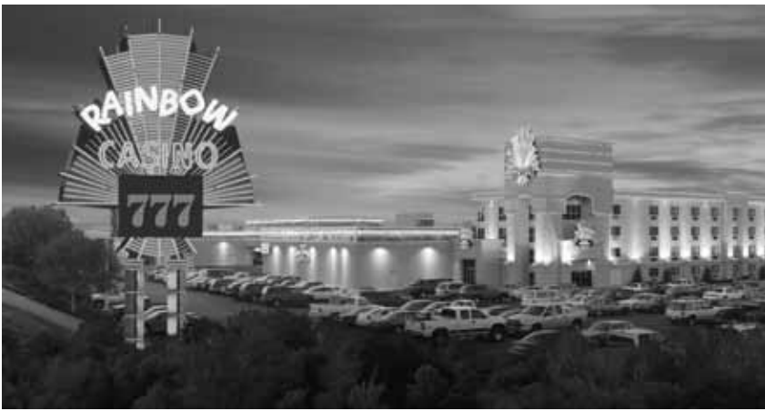
Rainbow Hotel, Casino