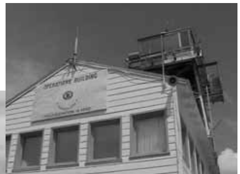
Wendover Field today