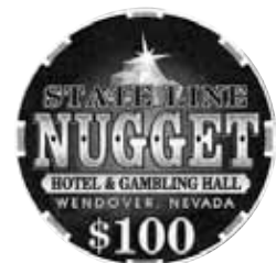
State Line Nugget Casino House Chips

Wendover's closed casinos include Jim's Casino and Saloon which operated from 1979 to 1983. Jim's was torn down to make room for The Silver Smith Casino. The A-1 Casino operated from 1956 to 1967, the Gold Rush Casino operated from 1981 to 1984 and was razed to make room for the Peppermill, the Hideaway Casino operated from 1976 to 1980.