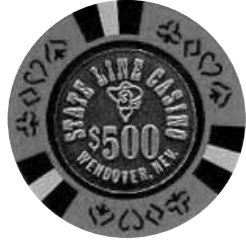
State Line Casino House Chips