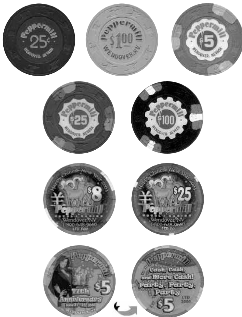
Peppermill Casino Chips