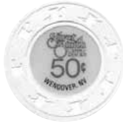
Silver Smith Casino House Chips