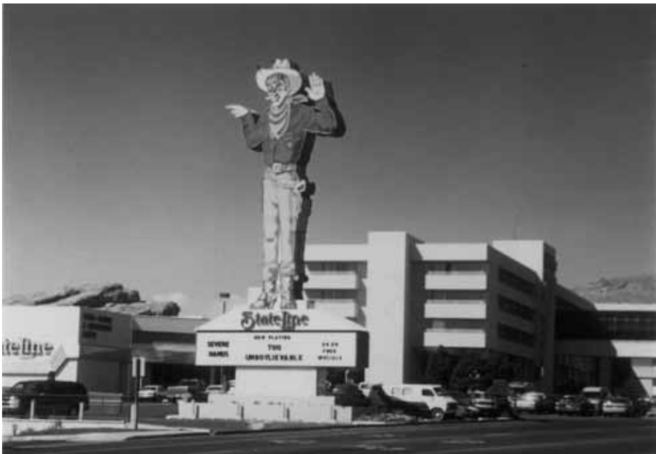
State Line Hotel, Casino