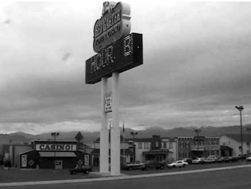
Red Garter Hotel, Casino