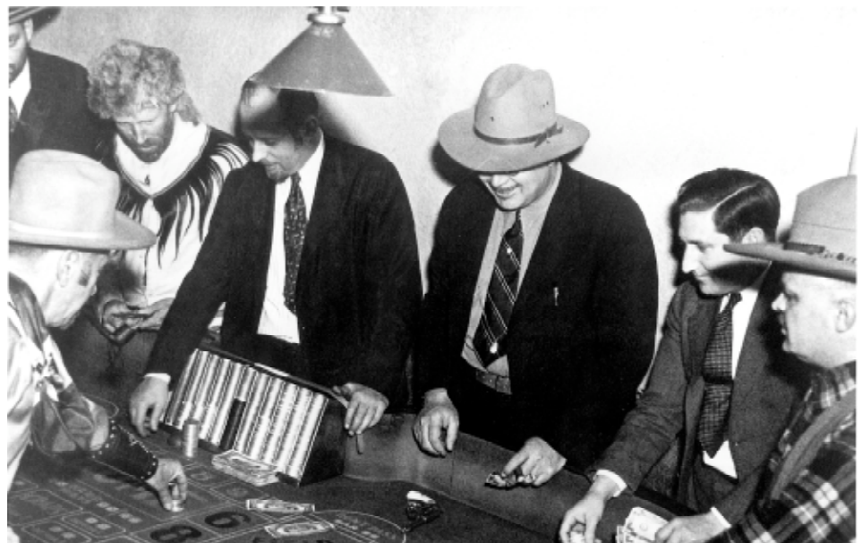
Notice the gun on the crap table