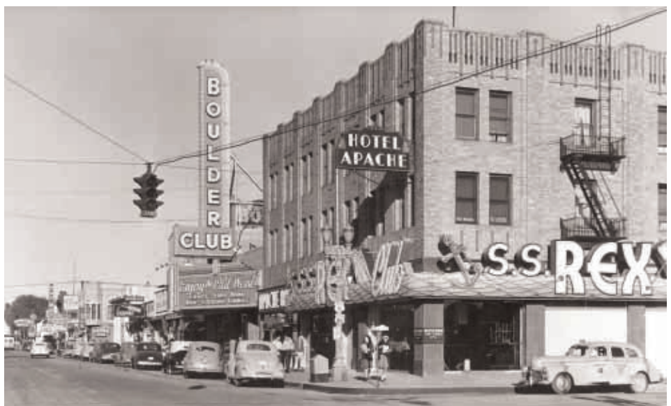
S.S. Rex Club 1945

Binion's Horseshoe 128 Fremont 4/23/60 - current