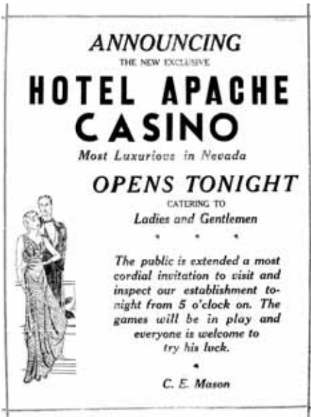
Las Vegas Age, March 19, 1932