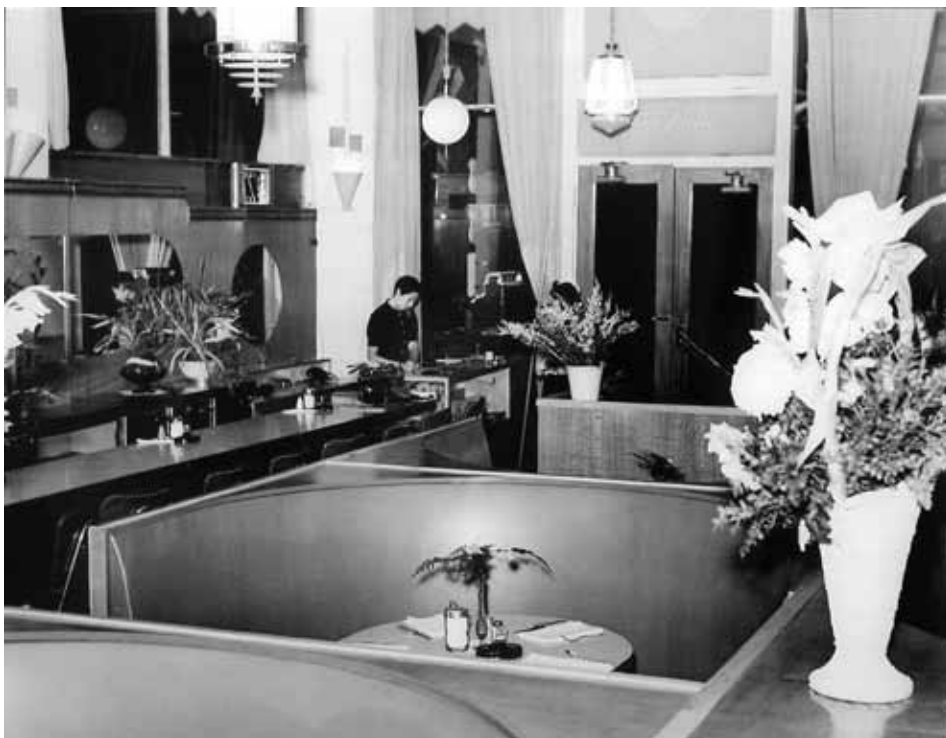
The Café was located at the corner of Second and Fremont